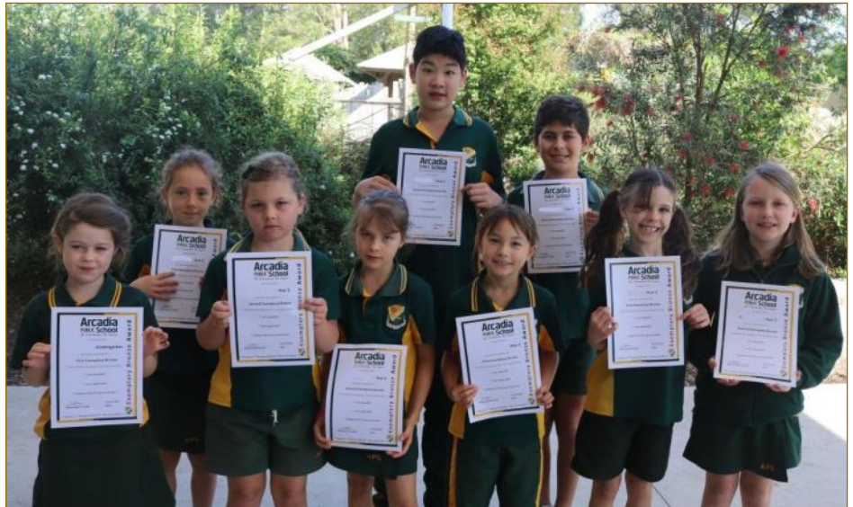
EXEMPLARY BRONZE RECIPIENTS - PBEL ROUND 2 FOR 2020