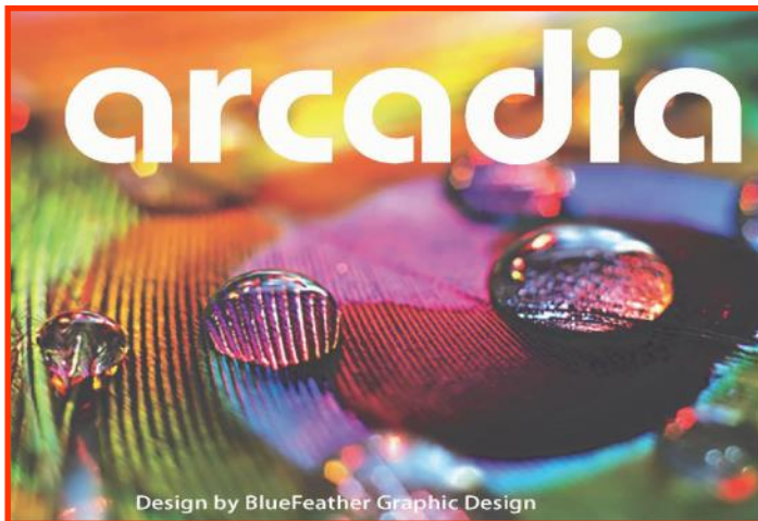
Design by BlueFeather Graphic Design

arcadia markets CANCELLED 2020 Due to COVID-19