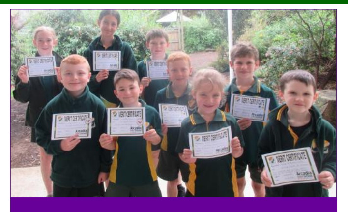
MERIT AWARD RECIPIENTS