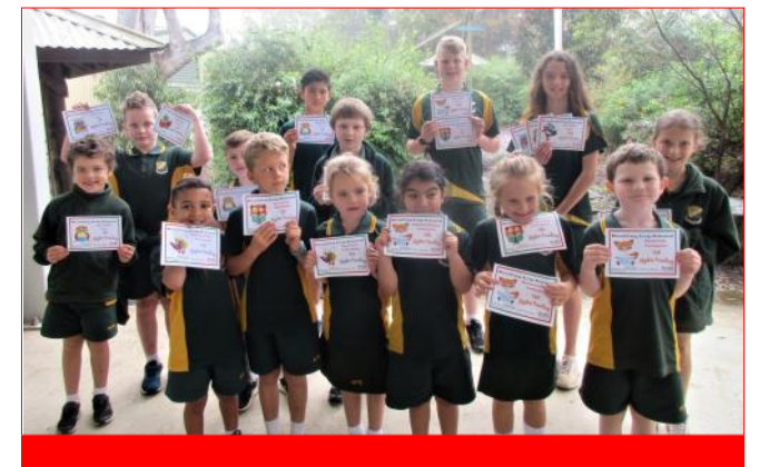
READING LOG AWARDS