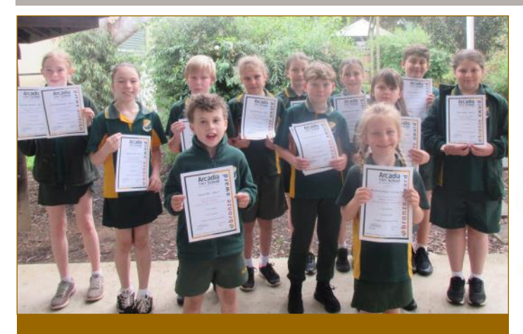
BRONZE AWARD RECIPIENTS