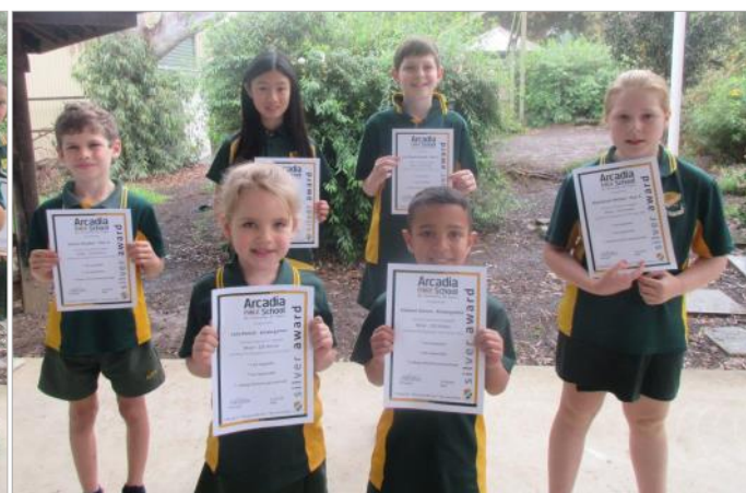
SILVER AWARD RECIPIENTS