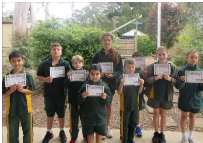
MERIT AWARD RECIPIENTS