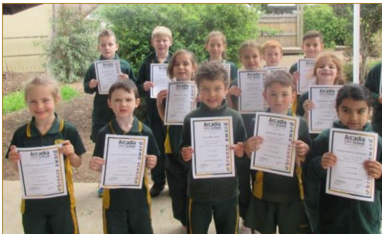
BRONZE AWARD RECIPIENTS