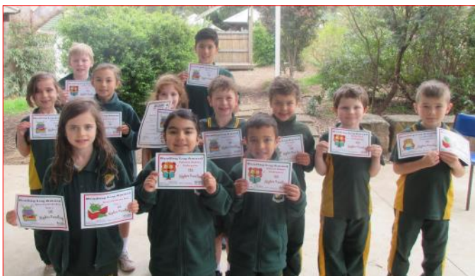
READING LOG AWARDS